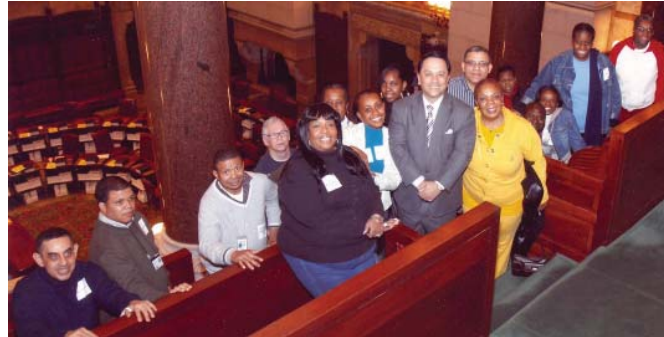
People from Metro Services visit with NYS Senator Pedro Espada, Jr.

We are now preparing for the January release of the Governor's 2010 – 2011 Budget which one Senator described as "the main event" and everyone predicts will be even tougher than this DRP battle.