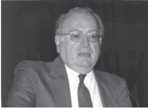
JACK M. WEINSTEIN, ESQ. Board Chair

On behalf of the Board of Directors, I want to welcome everyone to the 51 st CP of NYS Annual Conference. Especially in difficult times such as we face now, it is critically important that people with disabilities and their families, staff and volunteers from Affiliates and our State organization get together to exchange information and reaffirm common goals.